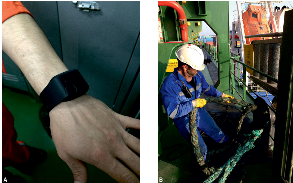
Figure 1. A. Electrodermal activity measurement device; B. Data collection in operation process

example, an average of 60 heartbeats per minute does not mean that it beats once per second. The heart rate is between 0.5 and 2 seconds. However, stress is determined according to the parameters based on frequency rather than those based on time. The fluctuations in the heart rate are resolved into numerical powers within certain frequencies. The low-frequency to high-frequency (LF/HF) ratio is an evaluation parameter and shows a sympathetic-parasympathetic balance. Increase in rate means the sympathetic activation while decrease in rate means the parasympathetic activation [51]. Adding to their specifications, the synchronisation of EDA and HRV shows the arousal and activation state [52]. EDA and HRV were used together to detect the vigilance or activation states of pilots, seafarers and automotive drivers [3, 19, 42].