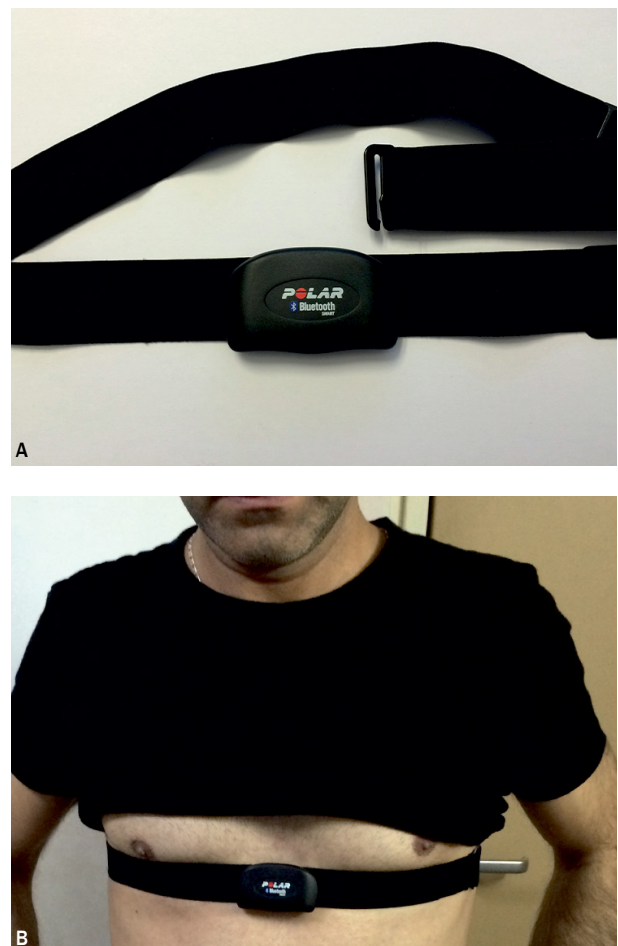
Figure 2. A. Heart rate variability measurement device; B. The use of the device

The reaction time refers to the duration from the activation of stimulation until the response to stimulation. The reaction time is divided into a simple stimulus versus a simple reaction time for which simple movement is expected and an optional reaction time at which desired movement is expected according to the type of stimulus [53]. According to Madden [54], the reaction time is a measure of the data processing speed of the central nervous system. When it is evaluated in terms of long working hours and the resulting lack